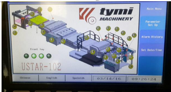
Machine Layout in Touch Screen Display